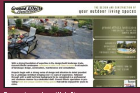
Future Lawn Inc., Web Sites