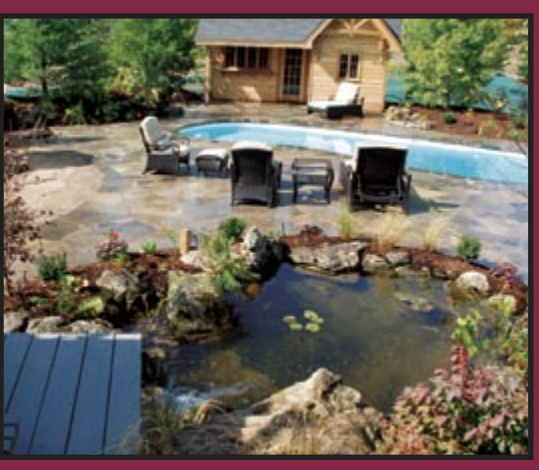
Tumber & Associates Residential Construction, $250,000-$500,000