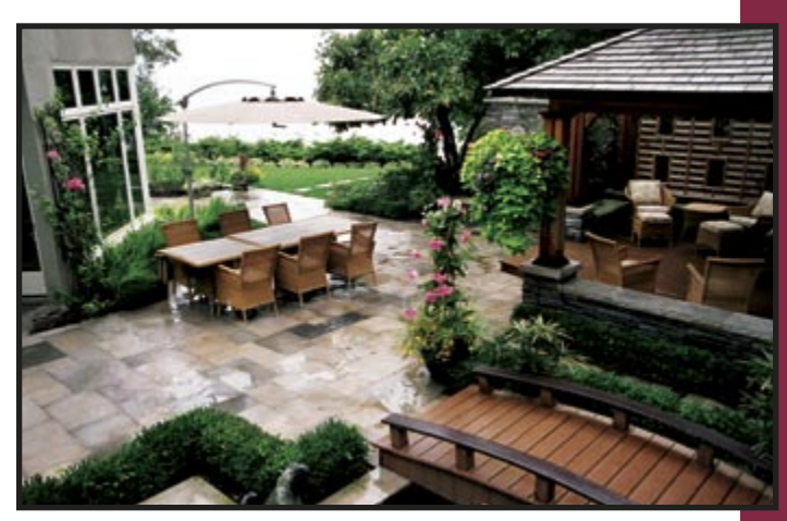
International Landscaping Inc., Dunington-Grubb Award for Best Overall Construction Project