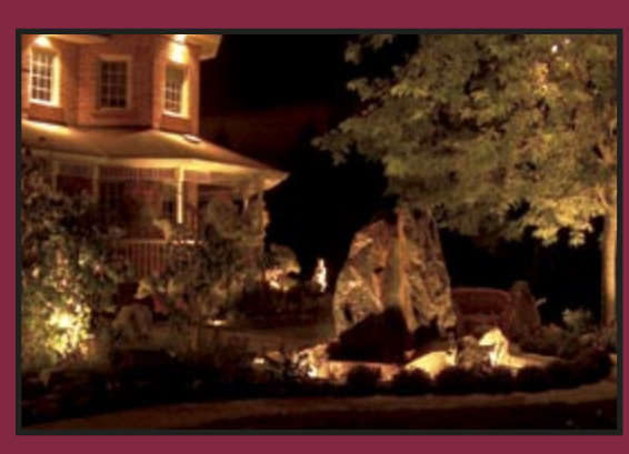
DiMarco Landscape Lighting, Landscape Lighting Design & Installation