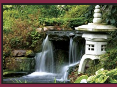
Garden Creations of Ottawa Ltd. Construction, Water Features