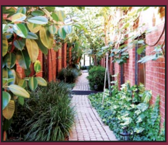
Moore Park Plantscapes Interior Landscape Maintenance Less than $2,500 service value per annum