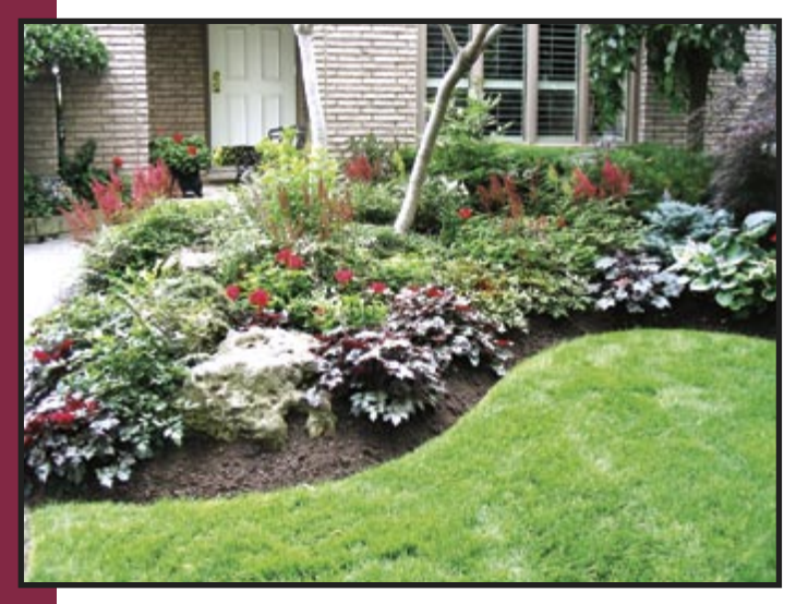
Evergreen Landscaping & Lawn Maintenance, Grounds Management Award for Best Overall Maintenance Project

From landscape construction and maintenance to design and interiorscaping, Landscape Ontario members shine in the quest for horticultural excellence. Each year, at Landscape Ontario's Awards of Excellence ceremony, landscape professionals join together to recognize top-notch talent. Hundreds of LO members turned out for the Awards ceremony and celebration of excellence on January 8, at Congress 2008.