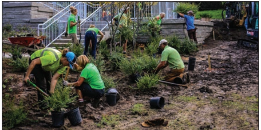
London Chapter volunteers planting at the HMCS Prevost site in the fall of 2016.

Participating on a chapter board is a very rewarding experience. Each chapter board consists of a president, vice and past-president, provincial board rep. (who liaises with LO's Provincial Board of Directors), a secretary, treasurer and various directors. The chapter board sets the schedule and topics for chapter meetings organizes fun, social networking events such as golf, squash and