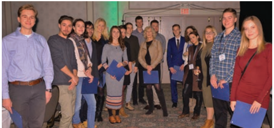
Scholarship recipients are recognized during the annual awards ceremony in January.